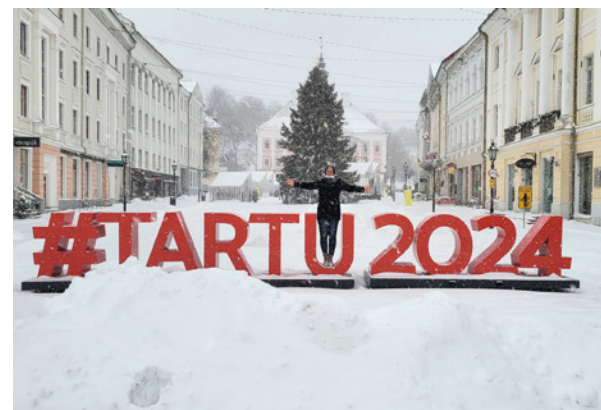
Tartu 2024: Opening party January 26th Tartu University | Inspiring: Tartu 2024